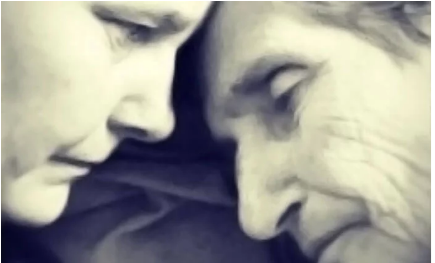
The author with her mother

“Take your time,” she said. “You don’t need to call the funeral home until you’re ready. Gather the people who will want to say their final farewells. Sit with your mom as long as you need to. When you’re ready, call and they will come to pick her up.”