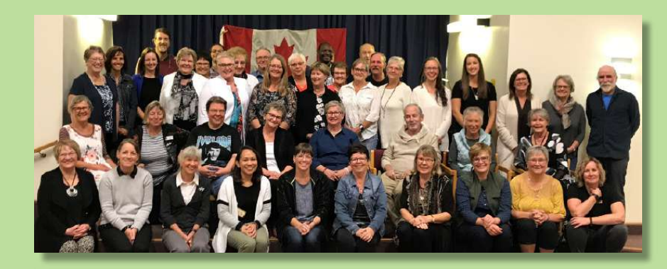
2019 Volunteer Appreciation Evening

Nine years later, your partnership fuels the Hospice Society of Camrose & District in its work providing support to those with a life-limiting illness, support for their families, and for those who grieve a loss. From compassionate bedside care to grief support, our donors, staff, and trained volunteers endeavor to enhance quality of life. We are hospice!